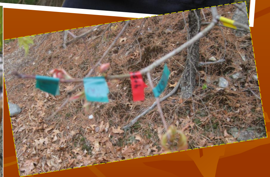
Labeling on tree branches.